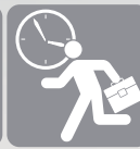
Work Order Tracking