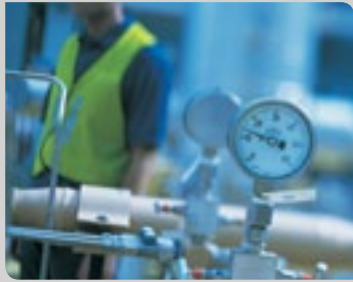
Field Force Automation